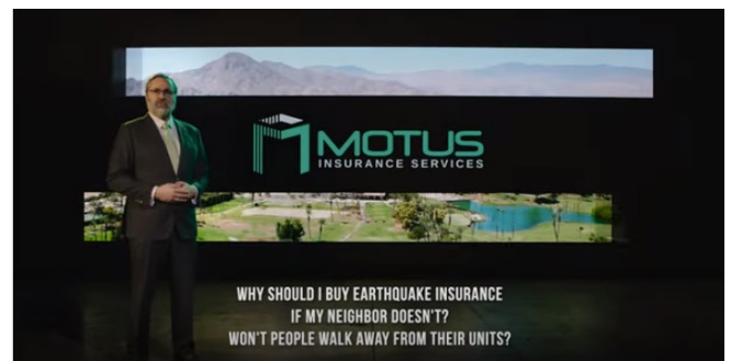
Video: Why Should I Buy Insurance if my Neighbor Does Not?